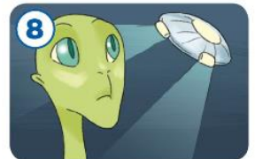
science fiction film