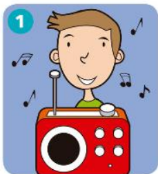
He listened to CDs.