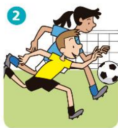
They played basketball.