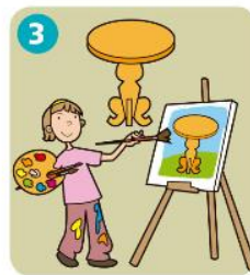
She painted a chair.