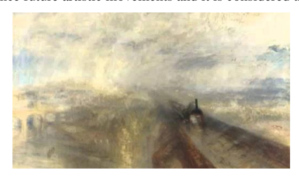
WILLIAM TURNER, Rain, Speed and Steam.

In England, the landscape was originally depicted by John Constable or William Turner , who will be advance future artistic movements and it is considered the precursor of abstract painting