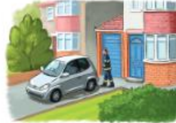
Go to work