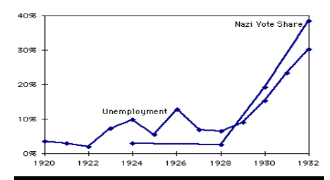
German Unemployment and Nazi Vote Share

companies started to close. By 1930, unemployment had reached 1 million.