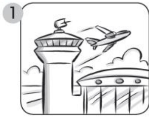
1 tiroapr airport