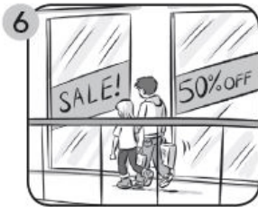
6 ongpshipi nreect _____