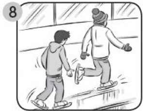
8 cei rkin _____