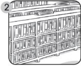
2 rayblir _____