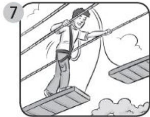
7 vtuaadreen nplaoudygr _____